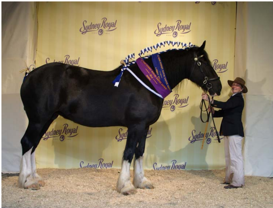
'Ingleside Elizabeth' Best Shire Exhibit 2005